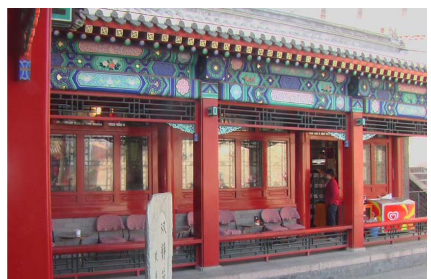
A shop at the entrance of the Great Wall – in ancient Chinese architectural style.