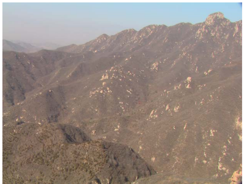
High hills and mountains - desolate and barren, beside the Great Wall at Badaling.